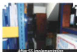
After 5S implementation

After the successful launching of "Clean Culture" through implementation of 5S in JAS Head Office at Suwarna, the program is now expanded to JAS operational area in CGK, covering Terminal 1, Terminal 2, Terminal 3, Cargo Area and Learning Centre at Taman Mahkota.