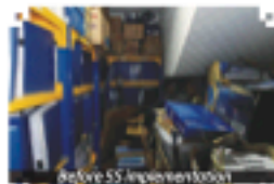
Before 5S implementation

After the successful launching of "Clean Culture" through implementation of 5S in JAS Head Office at Suwarna, the program is now expanded to JAS operational area in CGK, covering Terminal 1, Terminal 2, Terminal 3, Cargo Area and Learning Centre at Taman Mahkota.